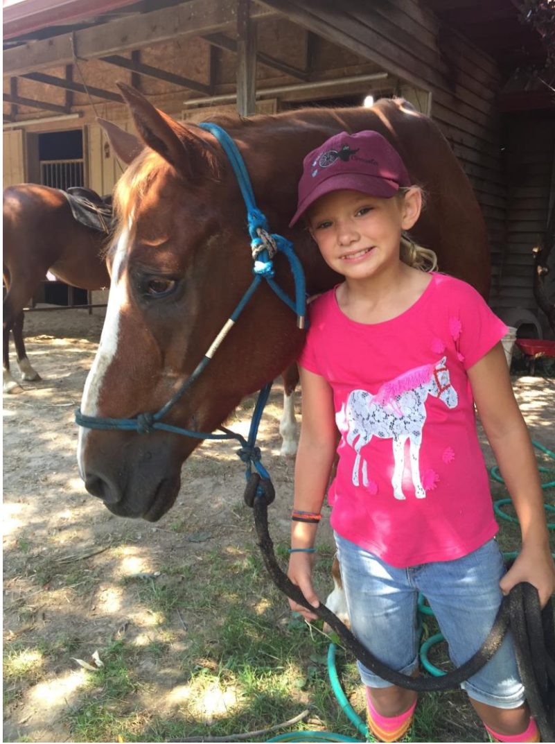
Holly and Dude